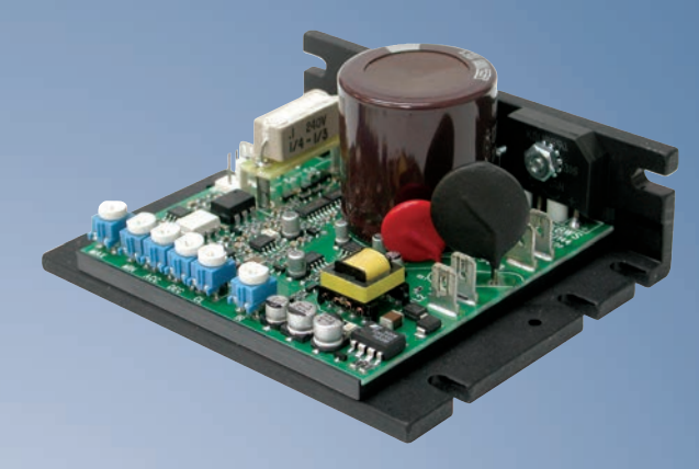
Model KBWS-15 Shown